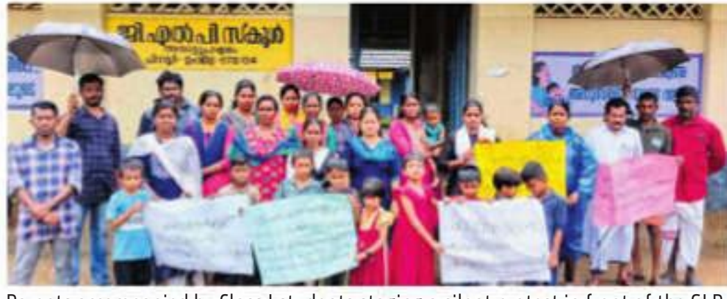
Parents accompanied by Class I students staging a silent protest in front of the GLP School, Ambattupalayam, on July 15

According to the parents and department authorities, the